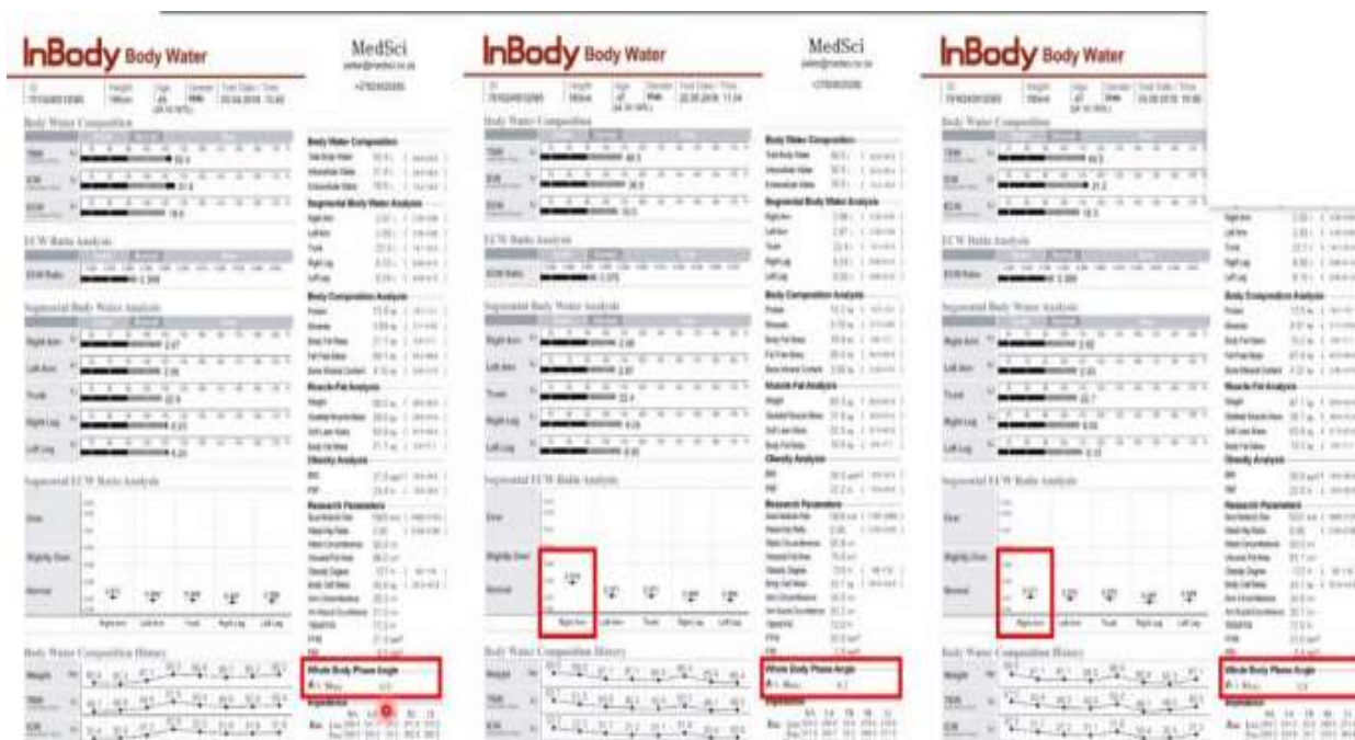
Figure 3: Shows Water Analysis

Water analysis helps to evaluate the content and amount of water stored in human body as well as its distribution into intracellular and extracellular fluid contents. Therefore, this system enables us to provide a direction to frame provisional diagnosis for various conditions such as edema, inflammation or muscle soreness etc. and also helps to provide insight of different stages of injury such as before injury, injury stage and recovery stage as in the Figure-3.