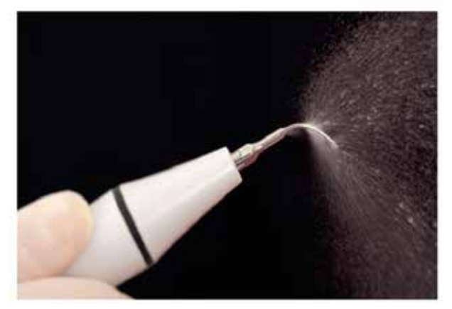
Figure 2: Aerosol production from ultrasonic scalers.

Studies reported ultrasonic scalers and air polishers as the greatest producers of aerosols in dental operatory<sup>47</sup>. Ultrasonic scaling produces considerable amount of aerosol spray, which can act as a vector for microorganisms and aid in spread of infection. These scalers when used produce a mixture of compressed air and water which spurts from the hand piece, further mixing with patient's saliva and blood forming a fine spray which ejects from the patient's mouth<sup>48</sup>. Aerosols producing devices reduce the air quality in dental office due to increased air contamination<sup>39</sup>. Aerosol from ultrasonic instrumentation always contains blood and lingers in the air for 30 min or longer in the dental offices or nearby areas<sup>32</sup> (Figure 2).